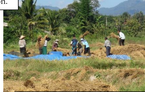
LBI Students harvesting rice and practicing worship songs in class.